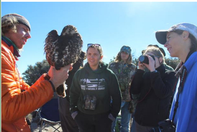
Listening to a HawkWatch biologist after capturing a Red-tailed Hawk in the Goshute Mountains