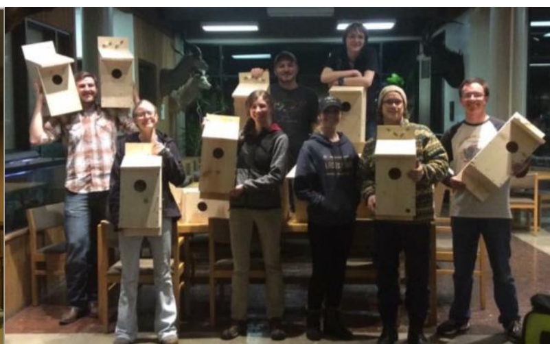
Students building American Kestrel nest boxes