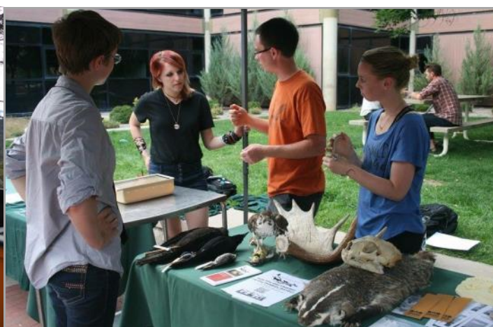
Educating students about TWS at a booth during the college's opening social