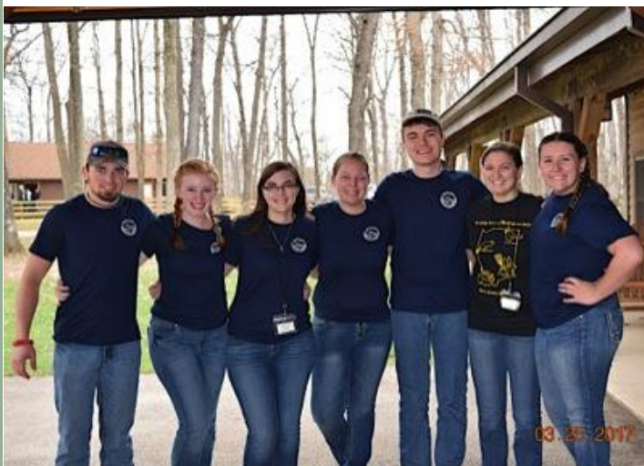
Members and activities of the University of Nebraska— Lincoln Student Chapter of The Wildlife Society