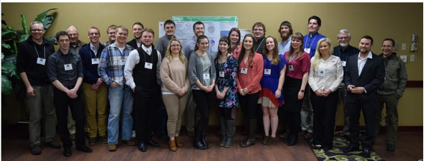
UND Student Chapter of The Wildlife Society attendees at the ND Chapter of The Wildlife Society Annual Conference