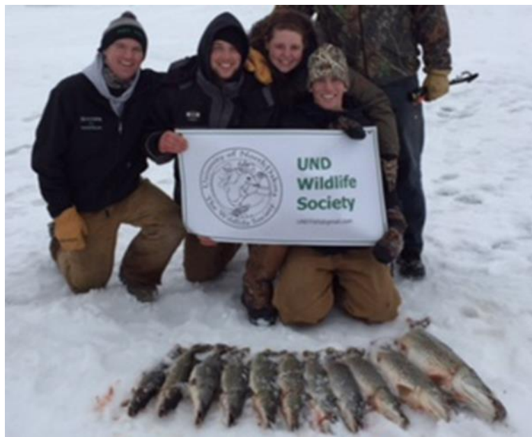
University of North Dakota Student Chapter of The Wildlife Society ice-fishing event on Devils Lake