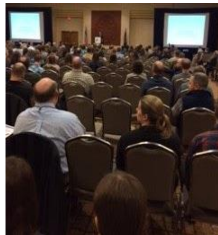
NETWS and Midwest Fish and Wildlife Joint Conference in Lincoln