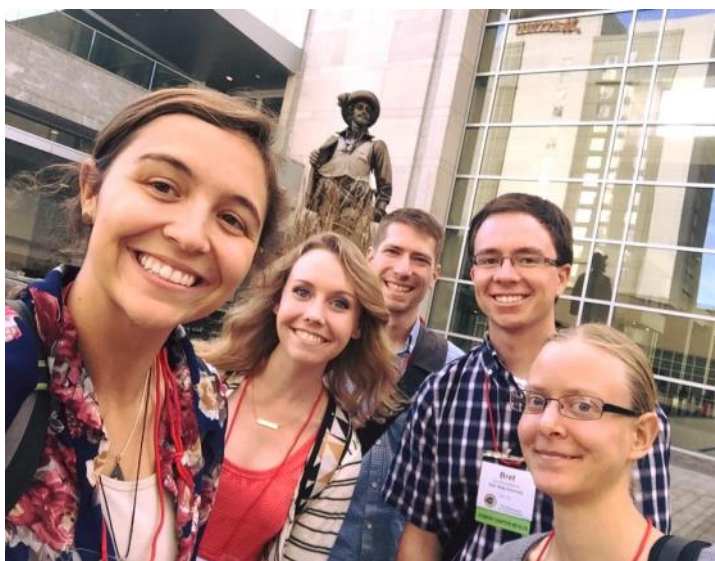
Utah State University students at TWS's Conference in Raleigh