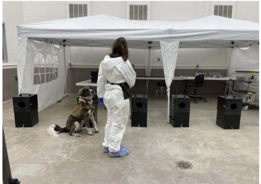
Custer alerts his handler as he detects a CWD positive sample.

“Five test boxes were arranged on elevated surfaces, one of which contained a CWD-positive fecal sam-