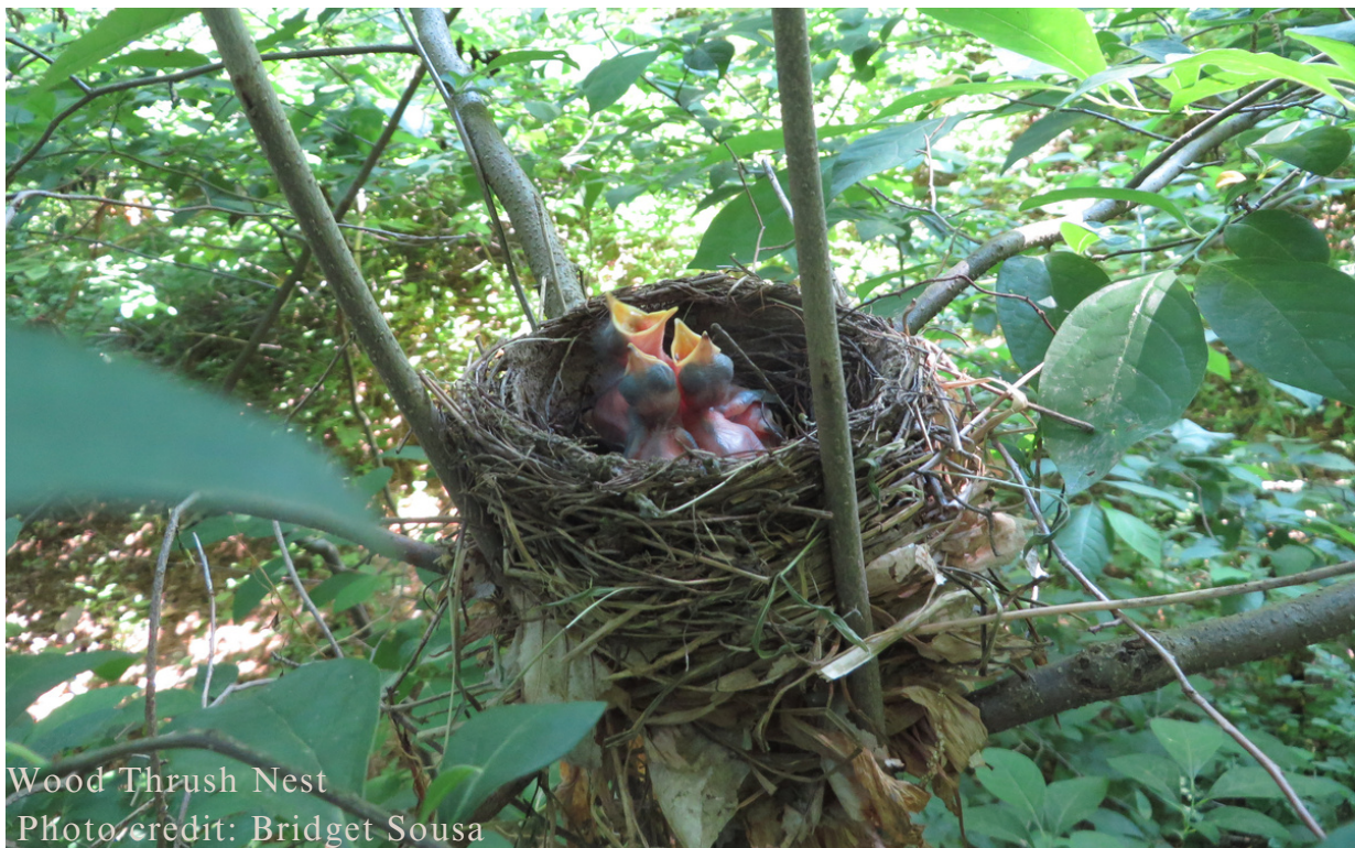
Wood Thrush Nest

Submit candidate's name, justifications, resumes, and letters of support to the awards.twsnortheast@gmail.com by 15 February each year.