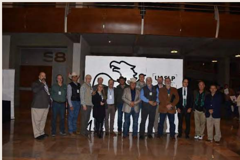
Collaborators from Southwest Section of The Wildlife Society and Wildlife Mexico Chapter TWS Asociación Civil during the second Mexico National Wildlife Conference.