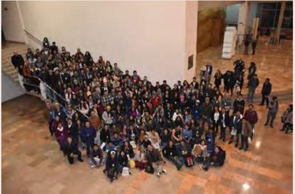
Attendees of the Second Mexico National Wildlife Conference.