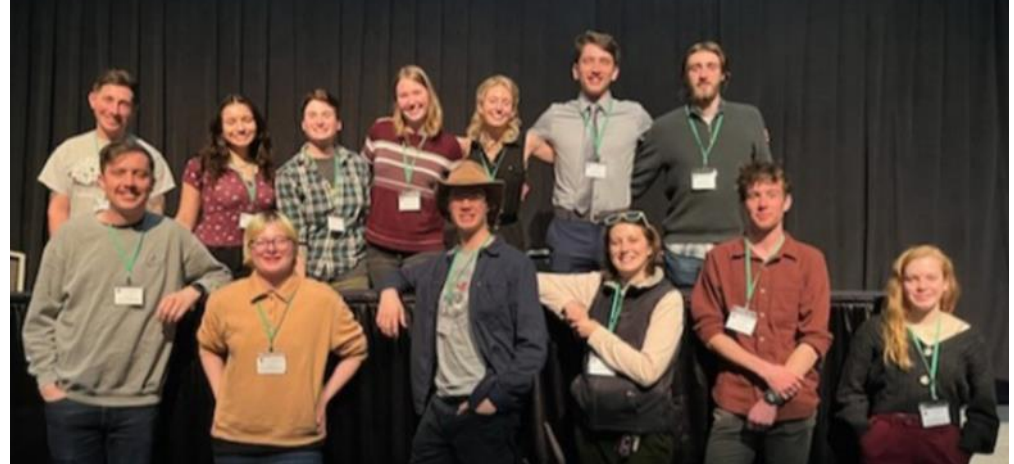
CSU, CSU Pueblo, and Western Colorado University Student Chapter members at the CCTWS 2024 Conference in Pueblo.

On 7-10 February, the Colorado Chapter of the Wildlife Society hosted their conference in Pueblo, CO, and we gathered seven of our members to participate in this wonderful opportunity. Our student chapter members met up with members from the other Colorado student chapters, CSU Pueblo and CSU Fort Collins. We were all able to schedule a meeting and catch up and got the chance to make up some