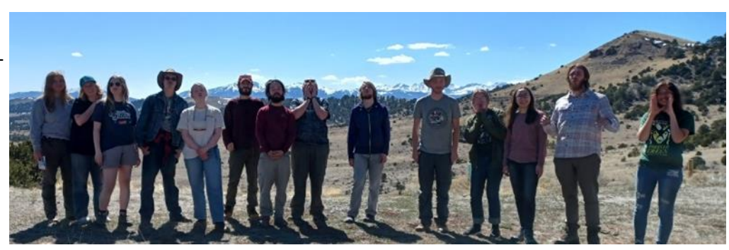
CSU Fort Collins and Western Colorado University Student Chapters of the Wildlife Society join forces at Mission Wolf in April 2024.

gy Undergraduate Research Fund, the MSE, MEM and EMPLOYS programs for travel support. The TWS CMPS also provided funding and encouragement. We are so blessed by members of the natural resources profession and others who generously shared their time and expertise with us this year.