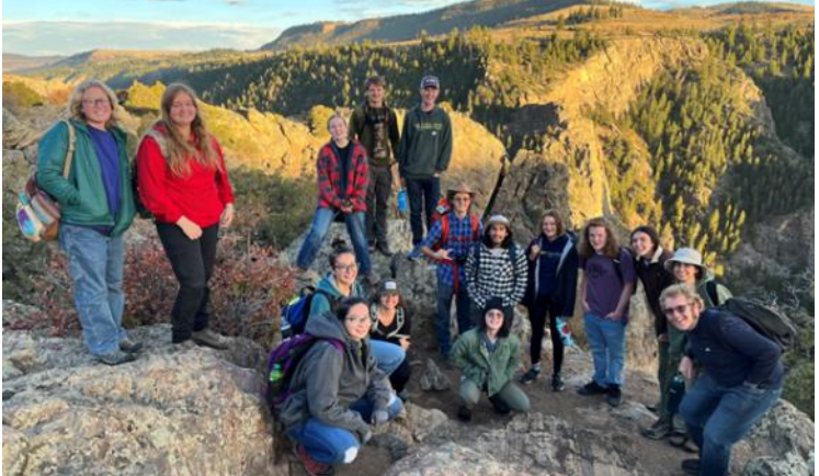
Photo of our group before our hike at the Black Canyon Curecanti National Recreation Area.

Finally, our biggest event of the fall of 2023, was gathering ten of our members to attend the 2023 annual TWS conference in Louisville, KY. It was a long two-day road trip from Colorado to Kentucky, and a long two-day trip from Kentucky back to Colorado, but gratefully, we were able to gather enough funding for our travel expenses. It was an above all, excellent opportunity to learn about different types of wildlife studies across the nation, meet people from all these fields including federal, state, and private offices, and discovering more about what we can do with wildlife conservation studies.