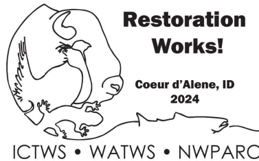
ICTWS • WATWS • NWPARC