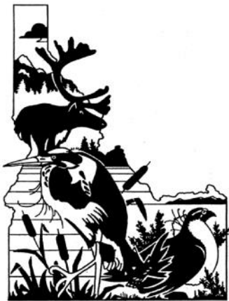
Idaho Chapter TWS