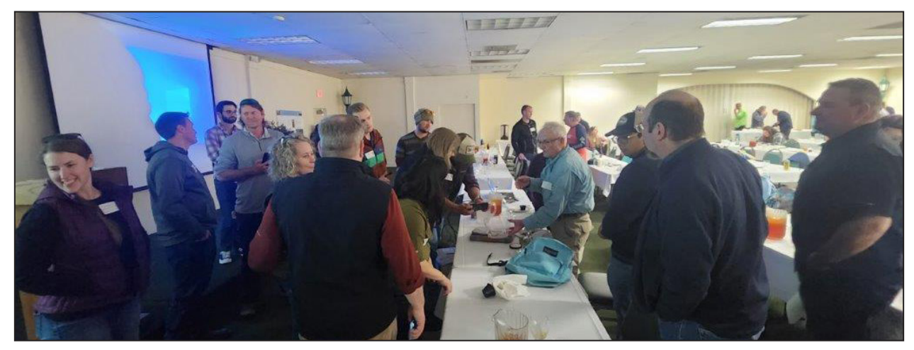
Legless Lizard (Anniella sp.) viewing and display table.