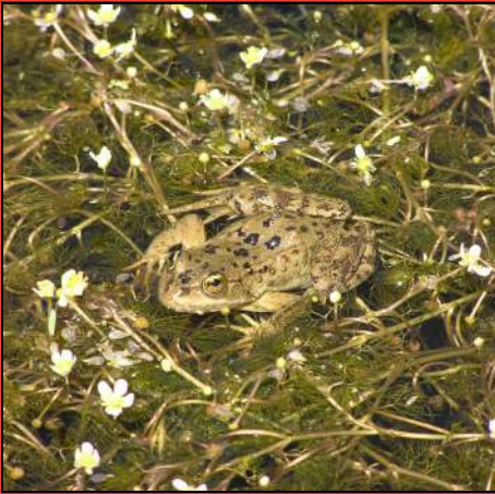
Columbia spotted frog

The Columbia spotted frog ( Rana luteiventris ) was designated as a candidate species for ESA listing in 1993. STWG funds were utilized in Utah to repatriate and successfully establish two populations of the frog in areas where they have been extirpated for over 30 years, thus helping to prevent the species from becoming endangered. STWG funds also provided the resources necessary to conduct the research used by USFWS in 2015 to determine that the species did not warrant federal listing. Through collaborative efforts—including clarifying objectives, utilizing sustainable grazing practices, creating ponds, and implementing effective conservation strategies—the frog population has rebounded across its range.