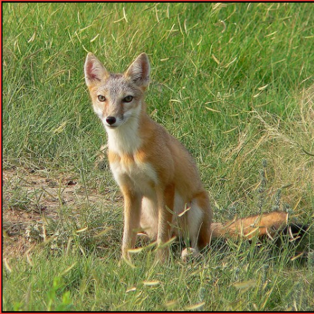
Swift fox