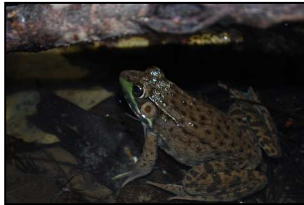
Western Chorus Frog

Each year, it is the responsibility of the Minister of Environment and Climate Change to prepare an annual report summarizing the administration's activities related to SARA, including assessments of the COSEWIC; enforcement and compliance actions taken; implementation of recovery strategies; regulations and emergency orders made; and any other matters that the Minister considers relevant. This report is in addition to the Wild Species report, also required under SARA. The Wild Species report is prepared once every five years and provides a general status assessment for a broad cross-section of nearly 12,000 native species.