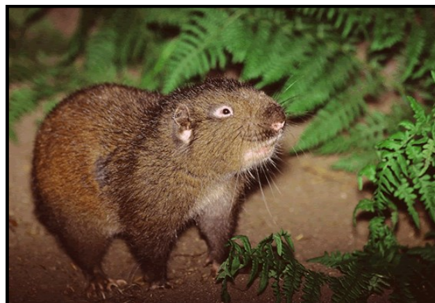
Mountain beaver

The mountain beaver ( Aplodontia rufa ) was reassessed as a species of special concern under SARA in 2012. The Mountain beaver is found in British Columbia, but its range has decreased by 29% in the last 50 years due to habitat loss. Habitat destruction has been caused by soil compaction and disturbance by heavy machinery during forestry activities and urbanization. Federal and provincial governments created a management plan for the mountain beaver in 2013 to improve the abundance of the species in British Columbia. This will be achieved through the implementation of best management practices for timber harvest in areas occupied by mountain beavers and conservation of other mountain beaver habitat. The goal is to prevent the mountain beaver from being listed as threatened under SARA.