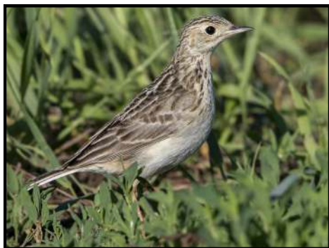
Sprague's Pipit