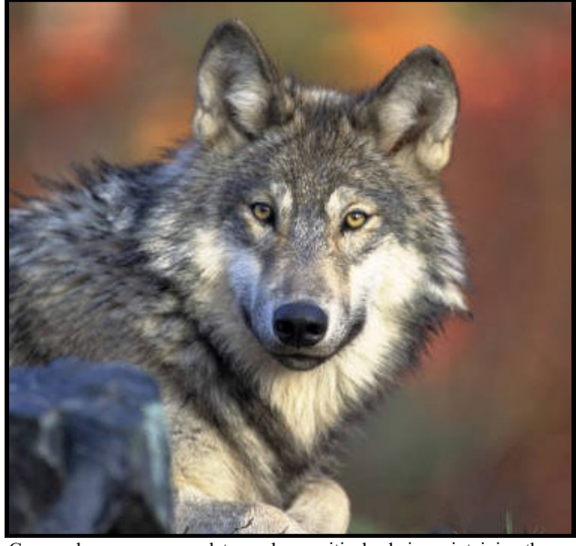
Gray wolves, as apex predators, play a critical role in maintaining the balance of an ecological community.<sup>4</sup>