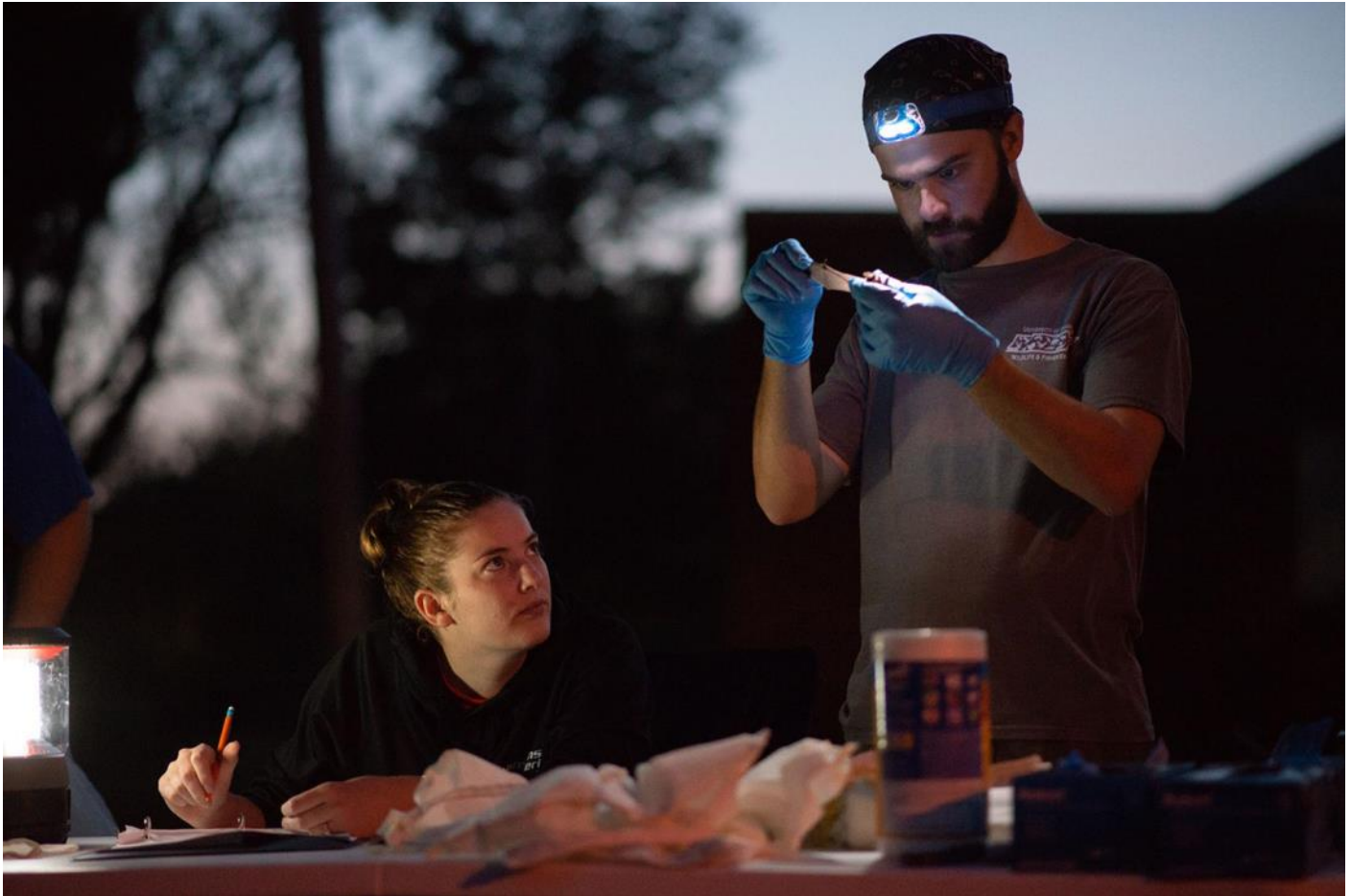
Pittsburg State University field work on gray bats ( Myotis grisescens) and other Myotis species.

Students with the Pittsburg State University Chapter of The Wildlife Society are developing field skills, scientific proficiencies, and mentor connections, which will serve them well in their careers and will benefit the wildlife profession. The Central Mountains and Plains Section of The Wildlife Society is thrilled to have them as part of our student chapter family.