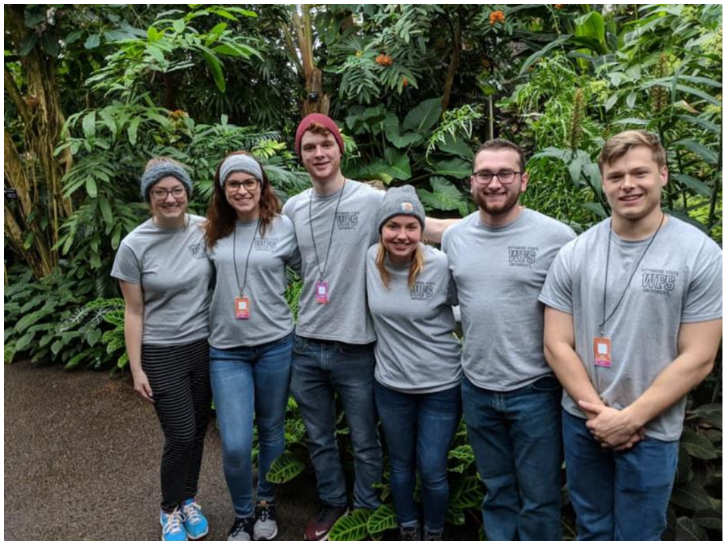
Students from the Pittsburg State University Wildlife and Fisheries Society ( https://www.facebook.com/groups/262227804299466 ).

For this next year, the PSU student chapter of TWS hopes to increase member participation. PSU is working to become a co-affiliate of The American Fisheries Society. They aim to give all of their members experience