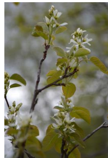
(left: beaver dam, center: northern great plains cotton- wood, right: serviceberry)