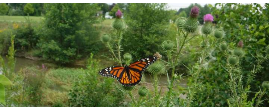
Monarch Butterfly ( Danaus plexippus ) on Tall Thistle ( Cirsium altissimum )—Laken Ganoë