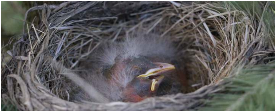
American Robin ( Turdus migratorius ) chicks—Laken Ganoë