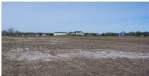
BEFORE: Saline soils, which are often marked by patchy white-caked areas devoid of plant residue, are a growing threat across much of South Dakota.