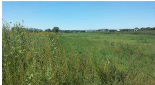
AFTER: Here's a photo of the same patch of ground six months after being planted with a typical perennial seed mix.