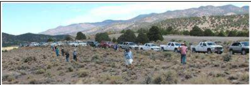
Bi-State field trip stop to share information local work group members and the general public.

These community based efforts such as the Bi-State Local Area Work Group , Stewardship Alliance of Northeast Elko (SANE) , Buffalo-Skedaddle Local Work Group , and others have worked closely with