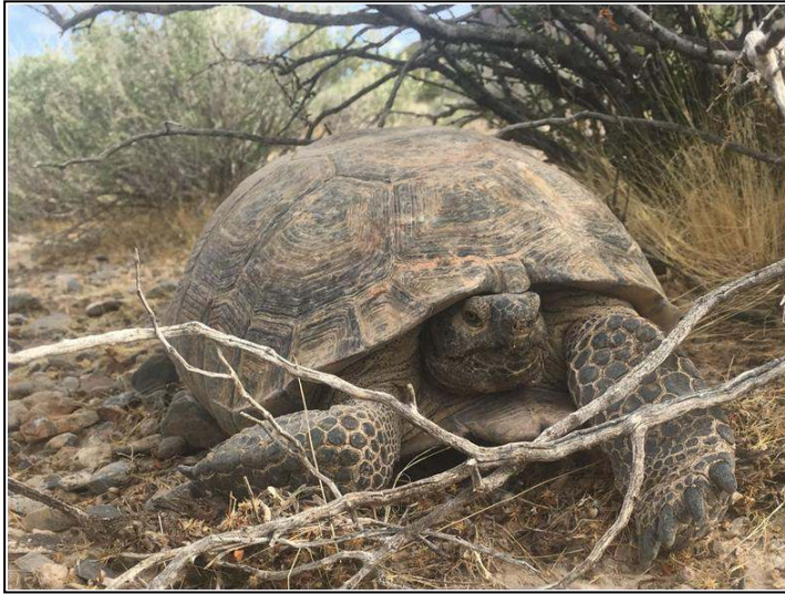
Mojave desert tortoise (Gopherus agassizii) in its native habitat

As a herpetologist with a particular affection for turtles and tortoises, there was one at-risk Nevada species that I was immediately excited to work with -- the desert tortoise. Luckily, I learned about a