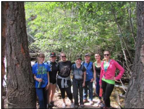
UNR Student Chapter on a hike at the Hunter Creek Trail.

The UNR student chapter is on track to having another great semester! One focus thus far has been trying to expand our membership. Members of the board gave presentations at the beginning of the semester to Wildlife Ecology and Environmental Science classes, emphasizing what a beneficial experience being a part of the Wildlife Society can be, in terms of learning and networking, but also having fun! We also participated in the UNR Club Fair, and between these activities had nearly 100 students sign up to receive information about the club's events and meetings. Our first general meeting at Laughing Planet was packed!