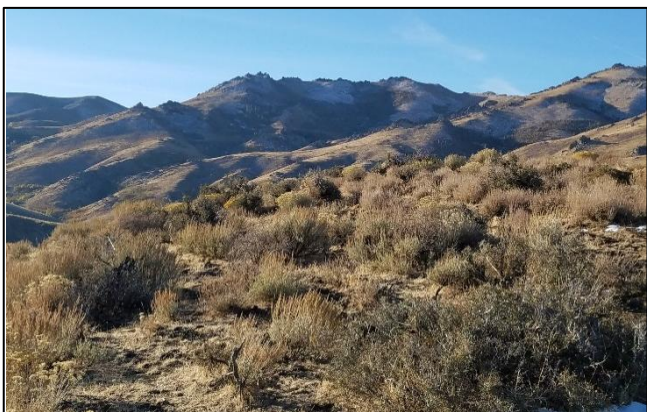
North central Nevada, October 2017

Over the last few weeks while out enjoying the great Nevada outdoors I have taken some time to reflect on the sage grouse issue that we have seen in the news lately. We have come a long way since 2010 and there are some really unsung contributions that have been difference makers. In 2010 Greater Sage grouse population in eleven western states along with the Bi-State Sage grouse Distinct Population Segment (DPS) were announced as Candidates for listing under the Endangered Species Act.