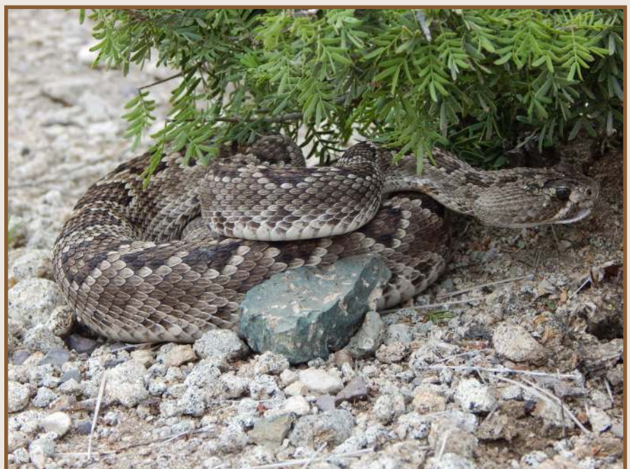
Crotalus scutulatus