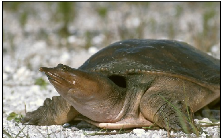
Florida Softshell turtle.

FWS and the Florida Fish and Wildlife Conservation Commission (FWCC) were able to prosecute turtle traffickers in 2012 through provisions in the Lacey Act. Three individuals were sentenced under the Lacey Act for illegally selling wild-caught turtles to China and falsifying documents. An owner of a turtle aquaculture facility used his FWCC Turtle Aquaculture Brood Stock Collection Permit to collect wild turtles and ship them to foreign markets instead of holding them for breeding purposes. At the time Florida's laws were insufficient to address the commercial profiteering; criminal charges would not have been possible without the Lacey Act.