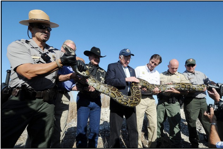
Former Interior Secretary Salazar and FWS Director Ashe with a python caught in the Florida Everglades in 2012.