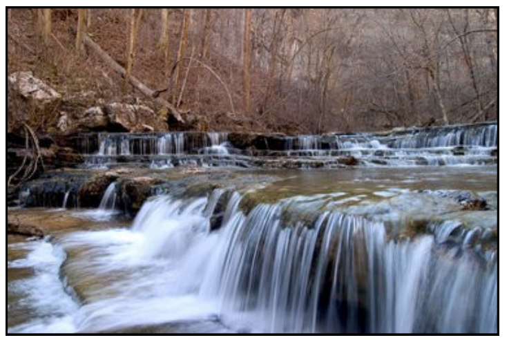
The headwaters of the Paint Rock River in the Walls of Jericho of Northern Alabama (Credit: Beth Maynor Young).

The LWCF is the primary funding mechanism for the Forest Legacy Program (FLP). The FLP, which is administered by the U.S. Forest Service, provides matching grants to states for forests projects that involve working lands. The states buy easements from private landowners to ensure sustainable use and habitat for wildlife. Over 2.3 million acres have been protected through FLP projects including the protection of the unique "Walls of Jericho" canyon and cave ecosystem in Tennessee and Alabama. USFS conserved 8,938 acres of the area through FLP which includes the headwaters of the Paint Rock River.