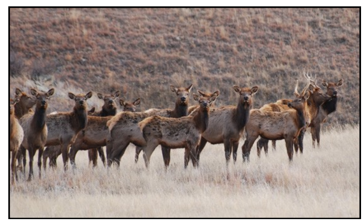
A herd of elk at Wind Cave National Park in South Dakota (Credit: Charlie Baker).

Elk herds are a huge draw to the Black Hills National Forest (BHNF) and Wind Cave National Park (WCNP) in South Dakota. Hunting and tourism bring in state revenue and are a large part of the local culture. $7.15 million in LWCF funds were used to purchase a 2400 acre ranch adjacent to the BHNF and WCNP. Elk herds consistently travel between the two federal areas and the private ranch. By incorporating the ranch into federal property, the elk herd (which uses the private ranch frequently) could be more effectively managed and more easily accessed by hunters and hikers alike