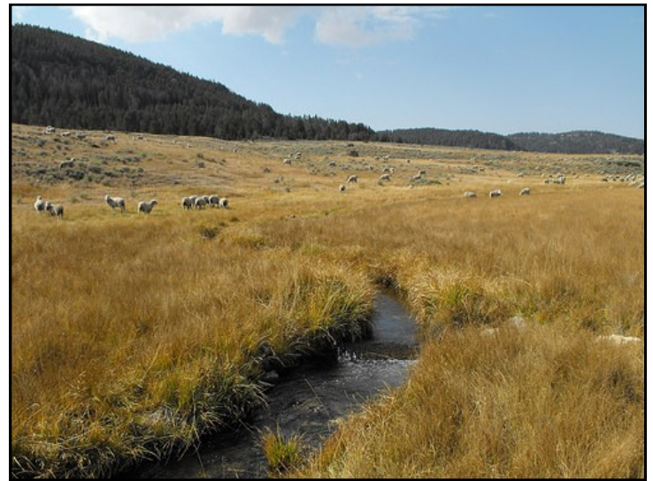
Beartrap Meadows in Wyoming is a vital stopover point for ranchers and migratory birds.

In Kaycee, Wyoming, a private ranch's plentiful and relatively wet grasslands are used by ranchers across the region as a stopover point when moving their herds. Beartrap Meadows is also a popular trout fishing spot and ideal habitat for sandhill cranes, mallards, and other bird species. To ensure the land is not developed, NRCS, local partners, and the landowners signed an easement agreement through NRCS to conserve the land in perpetuity. The easement prevents subdivision, allows ranchers and anglers to continue to use the property, and conserves the wildlife habitat.