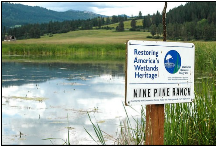
Nine Pine Ranch in the Colville River Valley in Washington has been restored to wetlands (Credit: NRCS).