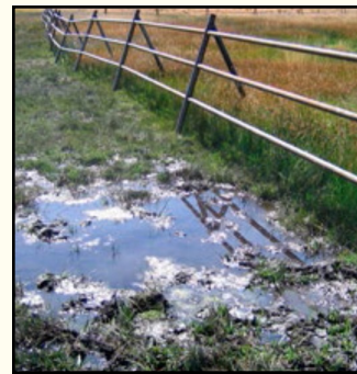
Feral horses and burros at the Sheldon National Wildlife Refuge, Nevada trample foliage and degrade rangelands. Areas inhabited by feral horses tend to have fewer plant species.

This map depicts BLM's Herd Areas (HA) and Herd Management Areas (HMA). Over 49,000 feral horses and burros range freely on public land throughout 10 western states 2.