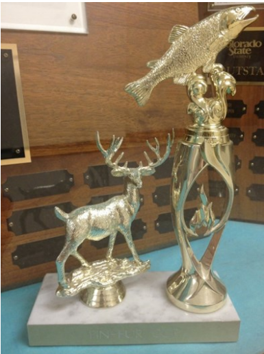
The Fin-Fur Cup trophy