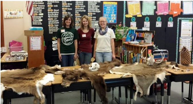
CSU TWS members at the STEM festival