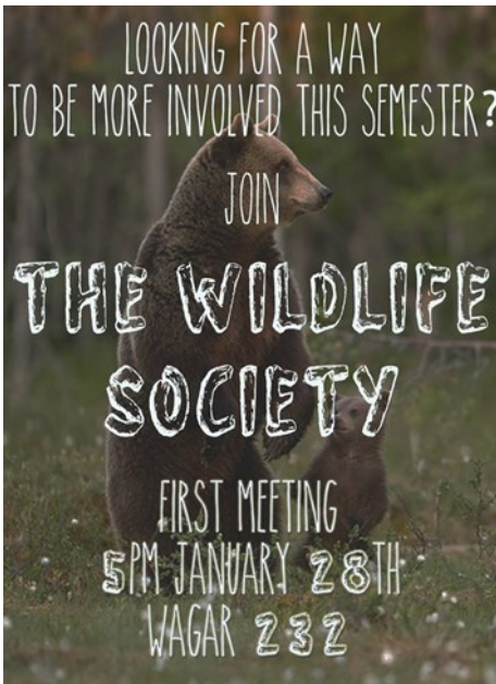
First Poster of the Semester for our Mock Mixer meeting

Seven of our members also attended the CCTWS Annual State meeting. They participated in workshops, plenary sessions, and volunteered, and reported the great experience they had at the CSU TWS meeting the following week. Many more of our members were able to attend the Student-Professional mixer on February 5 th and we would like to thank all the professionals who came out to make that event such a success.