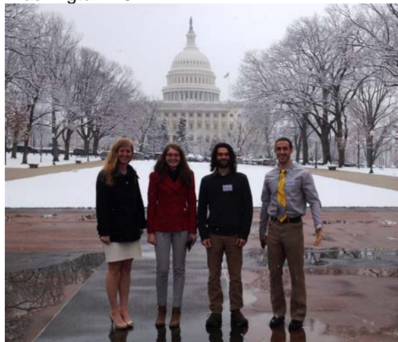
UConn Grad Students attend a Teaming with Wildlife Coalition event.

Wildlife Coalition's 2014 FLY-IN event in Washington DC.