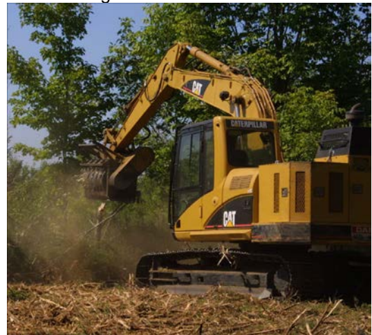
Bronto land clearing

The NH Fish and Game State Lands Habitat Program is working at Pisgah State Park in Chesterfield to maintain existing shrubland/young forest, to enhance an old apple orchard, and to create additional wildlife openings. Last year, NH Division of Forests and Lands and NHFG State Lands Habitat staff visited habitat projects that were initially completed in the late 90s – early 2000s to plan follow up work in these areas. Areas last mowed with a brontosaurus in the early 2000s are now a dense young forest with a mix of native shrubs. They will be following up with a bronto to mow regenerating hardwood trees while retaining soft mast producing native shrubs. Combined with selective herbicide applications on hardwood sprouts and invasive plants, this will help create a native shrub/grass/forb wildlife opening that will nicely compliment the commercial harvesting that is occurring nearby. Also, an abandoned apple orchard that was reclaimed in the late 90s will be reclaimed once again and maintained via brush hogging every couple of years. Additional wildlife openings will be created from a log landing that was recently used and a portion of an old pasture pine stand that was recently cleared during a timber harvest.