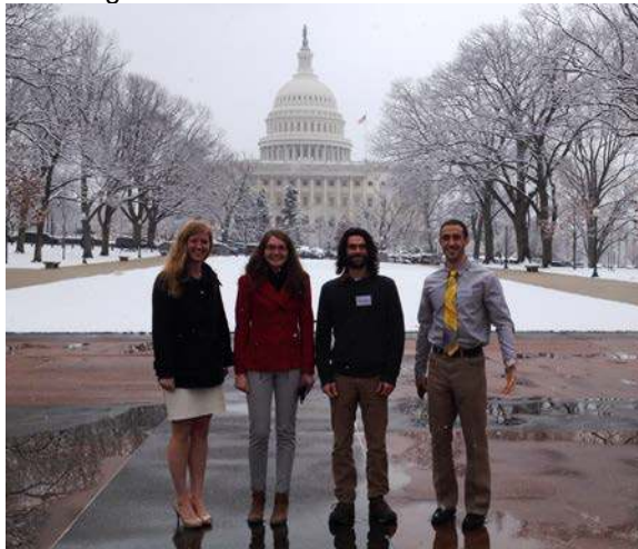
UConn Grad Students attend a Teaming with Wildlife Coalition event.

Wildlife Coalition's 2014 FLY-IN event in Washington DC.