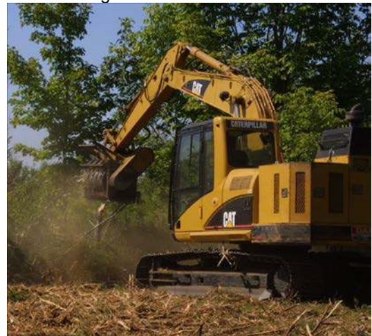
Bronto land clearing

The NH Fish and Game State Lands Habitat Program is working at Pisgah State Park in Chesterfield to maintain existing shrubland/young forest, to enhance an old apple orchard, and to create additional wildlife openings. Last year, NH Division of Forests and Lands and NHFG State Lands Habitat staff visited habitat projects that were initially completed in the late 90s – early 2000s to plan follow up work in these areas. Areas last mowed with a brontosaurus in the early 2000s are now a dense young forest with a mix of native shrubs. They will be following up with a bronto to mow regenerating hardwood trees while retaining soft mast producing native shrubs. Combined with selective herbicide applications on hardwood sprouts and invasive plants, this will help create a native shrub/grass/forb wildlife opening that will nicely compliment the commercial harvesting that is occurring nearby. Also, an abandoned apple orchard that was reclaimed in the late 90s will be reclaimed once again and maintained via brush hogging every couple of years. Additional wildlife openings will be created from a log landing that was recently used and a portion of an old pasture pine stand that was recently cleared during a timber harvest.