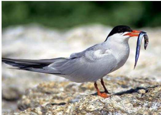
Common tern

The Nongame and Endangered Wildlife Program has entered into a contract with the University of New Hampshire's Cooperative Extension to study the movements and feeding patterns of terns. Common terns at the Isles of Shoals will be captured and equipped with nano tags and their movements will be tracked to identify where they go and what habitat/landscape features they are using when they are not on the island.