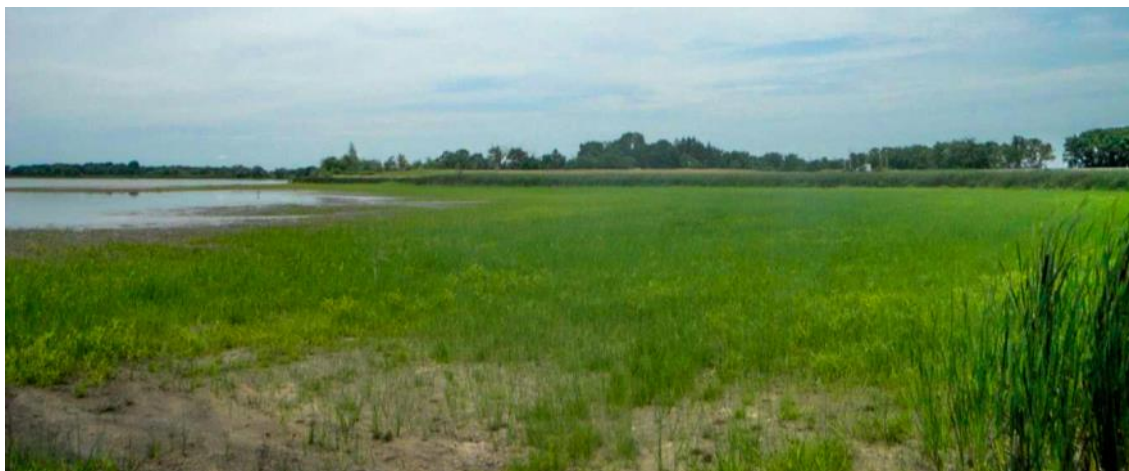
Smith Lake in Wright County. Bulrush sprouting on mud flats during drawdown. July 22, 2011.