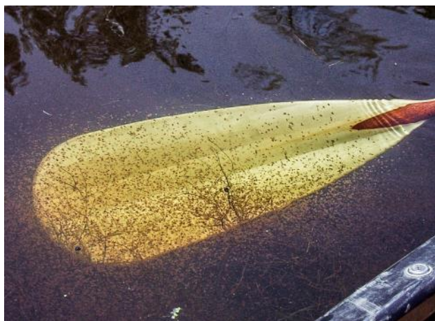
Daphnia response when Smith Lake was re-filled after the drawdown. May 21, 2012.