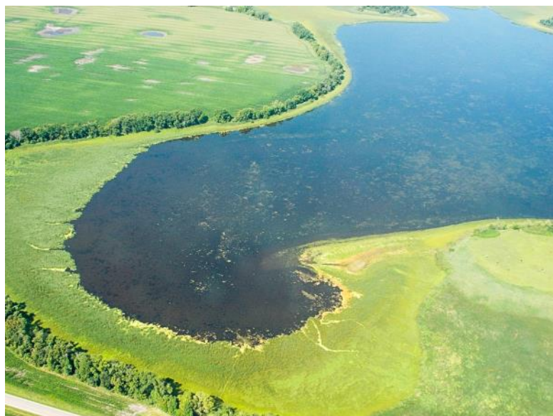
Fringe of emergent vegetation and beds of submerged vegetation on Smith Lake after being re-filled. July 10, 2012.