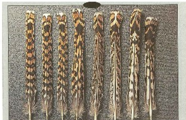
Central tail feathers from male and female sharp-tails. The coloration of these feathers is an indicator of sex. The four feathers on the left come from females. Note the alternating buff-black horizontal striping. The four male tail feathers on the right show more solid, and the striping pattern is more vertical and not as consistent as in the female feathers.