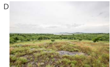
A. Broken Bow, B. Optima, C. Spavinaw GMA, D. Mountain Park