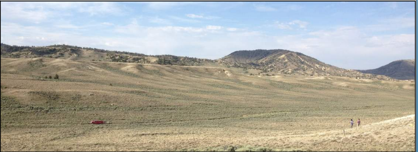
Wildlife technicians in search of pygmy rabbits near Crook's Gap, Wyoming in June 2012.