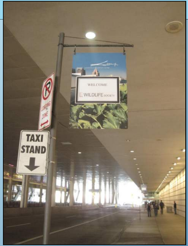
Curbside greetings from the David L. Lawrence Convention Center.