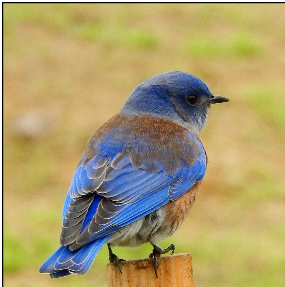
Western bluebird, Chino Hills, CA. An excellent photo by Howard Clark, chapter webmaster.