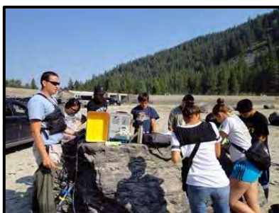
Photo was taken at the 2013 Pacific Region Youth Practicum held @ Blue Bay Lodge on the Confederation Salish & Kootenai Tribes Reservation