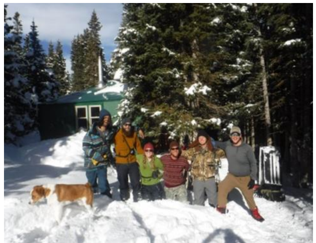
Last day of an incredible three-day weekend spent at The Ridgway Hut, a mere 7 mile hike (January 2016).

In March, for our Spring Break, ten of our students decided to volunteer in order to perform conservation work in conjunction with The Grand Canyon Trust. This work entailed performing spring restoration work along the base of Vermillion Cliffs National Monument. We did activities such as remote trigger camera maintenance, rock-bar construction for water erosion prevention, invasive species pulling and control, and transplanting native plant species to increase survivability. This work was inspiring and meaningful, working on desert oases which support such a diverse array of species. Through looking at pictures collected by the game cameras we saw animals such as bobcats, coyotes, rabbits, birds of prey, desert bighorn sheep, and bats who utilized the springs as an important resource for their lives. Also at the springs, we saw tadpoles and a vast array of macroinvertebrates who were loving life in these wonderful cold water pools. We stayed at a place called Kane Ranch. This ranch was es-