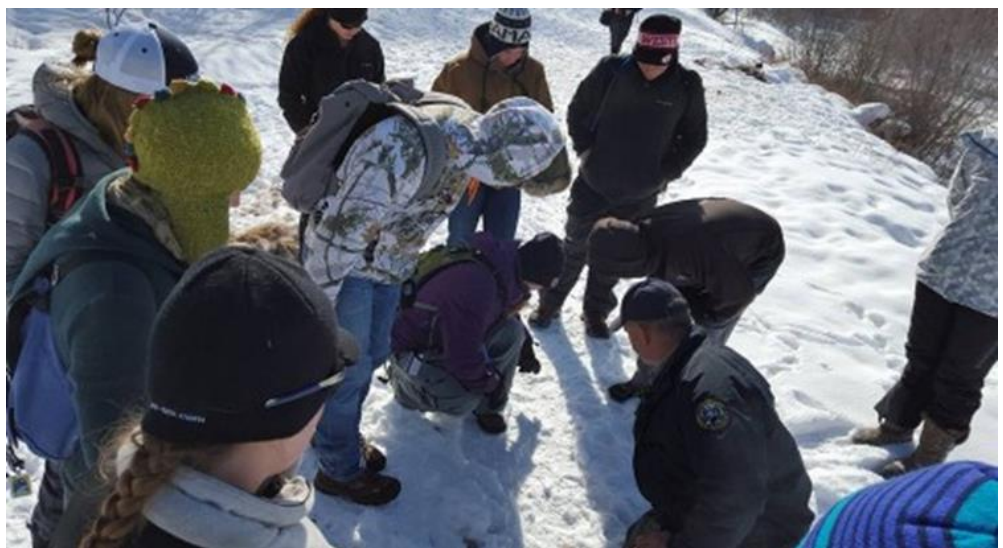
Working on a snow-tracking workshop with Colorado Parks and Wildlife and The United States Forest Service, students learned how to tell stories through footprints (January 2016).