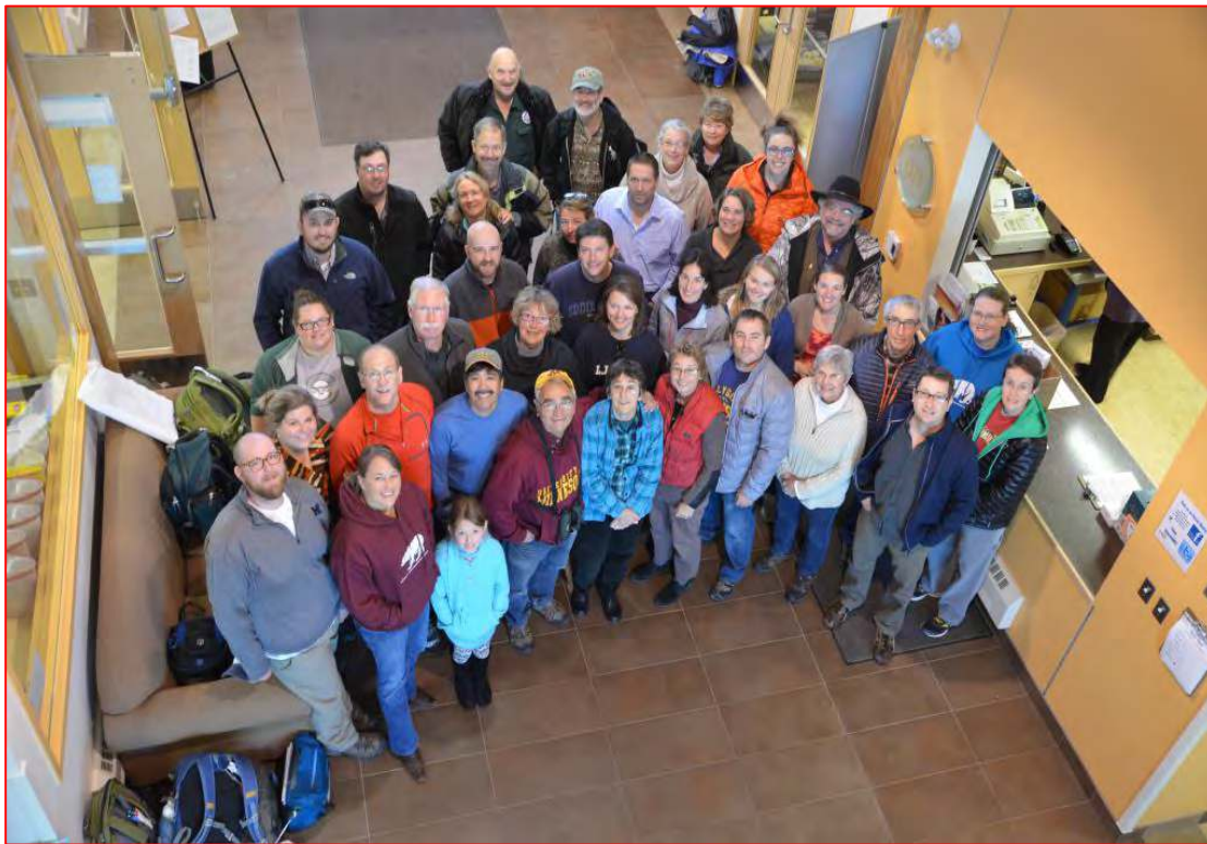
Thirty-six TWS members visited the Churchill Northern Studies Centre after the annual conference in Winnipeg.

The entire trip through Canada was awesome. The Society as a whole has amazing opportunities to learn, explore, and advance career and personal goals. I am excited to continue my involvement with the Society and encourage all chapter members to engage themselves, locally, nationally or internationally.