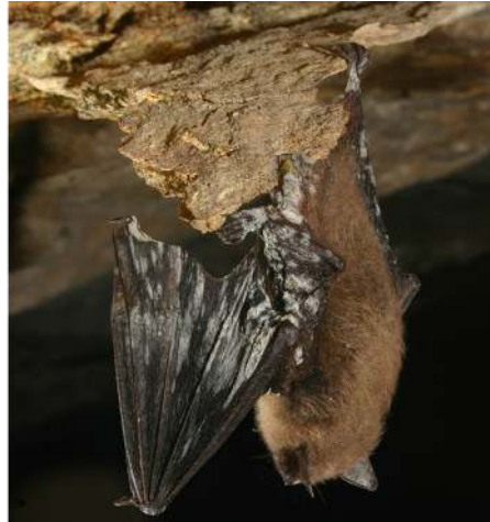
Figure 1. Little brown bat with white-nose syndrome. Areas of white fungal growth are visible on the surface of the wing membrane, which appears dull and dehydrated. Photo credit: Al Hicks, 2008, Main Graphite Mine, Warren County, NY.

Coincidentally, P. destructans also thrives in cold conditions and has an affinity for bats. The