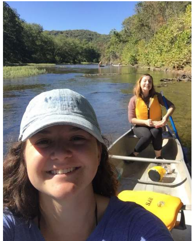
The otter float trip on the Raystown Branch of the Juniata. On the trip, we found four or five active otter latrines along the bank!