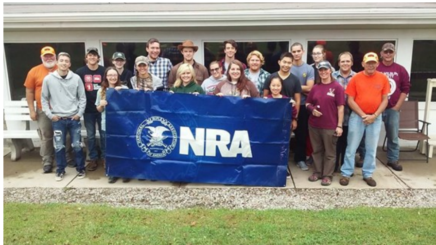
Student Chapter at Roscoe Field Day