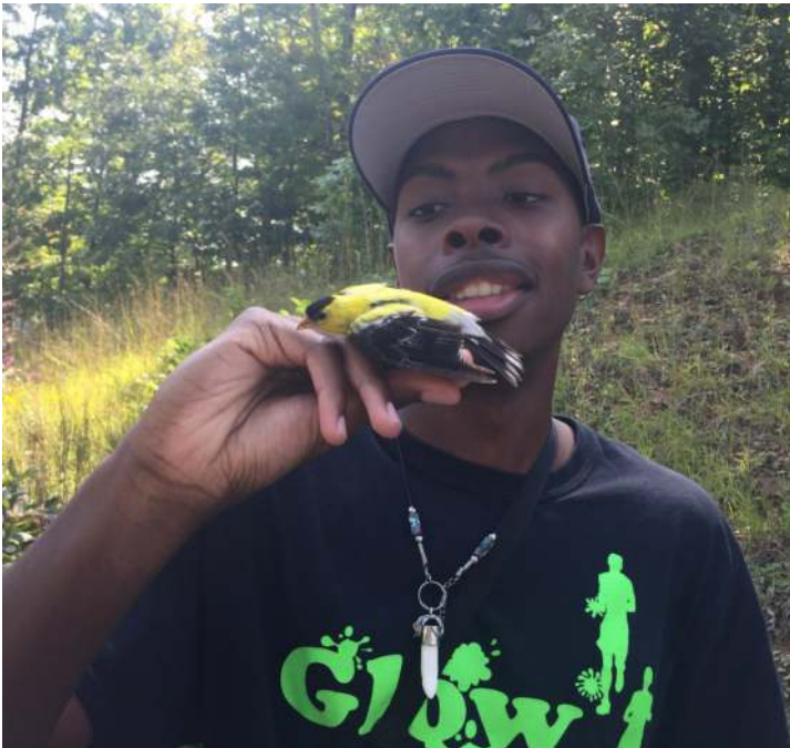
Mist netting during our freshman wildlife program was a success!