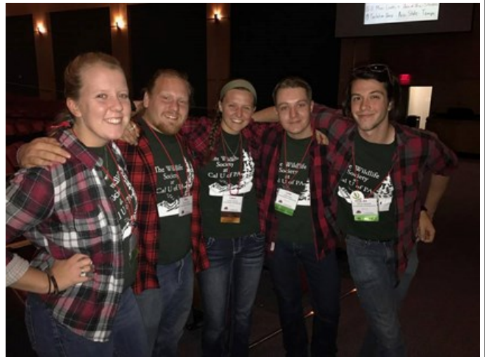
Quiz bowl team at National Conference

Since coming back from New Mexico the club already has a variety of activities planned. Example of some of our activities include our annual camping trip in Benezzete, Pa and our annual field day at the Roscoe rod and gun club where students are exposed firearms and are taught how to properly care and use them. In addition at the end of October the Cal-U of Pa student chapter will be heading out to the Wilds in Cumberland Ohio for a weekend to take a weekend long ecological restoration certification course. Additional activities the student chapter intends to conduct this semester includes a number of smaller fundraisers, hiking trips, and continuing to work towards establishing our environmental education program.