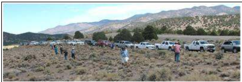
Bi-State field trip stop to share information local work group members and the general public.

These community based efforts such as the Bi-State Local Area Work Group , Stewardship Alliance of Northeast Elko (SANE) , Buffalo-Skedaddle Local Work Group , and others have worked closely with