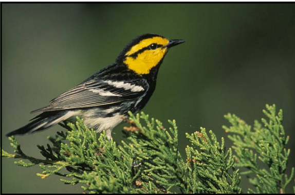
Golden-cheeked Warbler.