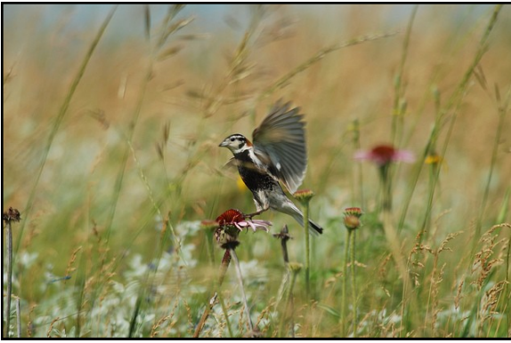
Chestnut-collared Longspurs benefit from the U.S. - Mexico Grasslands Conservation Project.