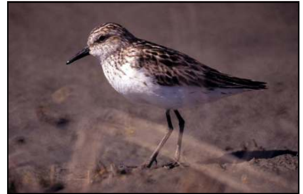
Semipalmated Sandpiper (Credit: USFWS).

The Arctic Shorebird Demographics Network (ASDN) is a collaboration of 17 partners in the U.S., Canada, and Russia to study the decline of arctic shorebirds. Studied species include the Dunlin ( Calidris alpina ), Semipalmated Sandpiper ( Calidris pusilla ), and Whimbrel ( Numenius phaeopus ). ASDN has been conducting field studies since 2010 and received NMBCA funding in 2011 and 2012. ASDN received over $279,000 in grants with an additional $862,000 in matching funds through their NMBCA applications in those two years.