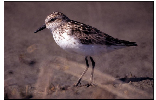
Semipalmated Sandpiper.

The Arctic Shorebird Demographics Network (ASDN) is a collaboration of 17 partners in the U.S., Canada, and Russia to study the decline of arctic shorebirds. Studied species include the Dunlin ( Calidris alpina ), Semipalmated Sandpiper ( Calidris pusilla ), and Whimbrel ( Numenius phaeopus ). ASDN has been conducting field studies since 2010 and received NMBCA funding in 2011 and 2012. ASDN received over $279,000 in grants with an additional $862,000 in matching funds through their NMBCA applications in those two years.