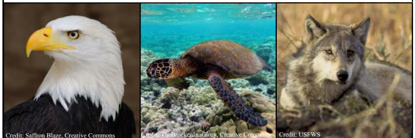
ESA listings over time, including from left to right: bald eagle (status: delisted); green sea turtle (status: endangered); gray wolf (status: delisted/some distinct population segments endangered)