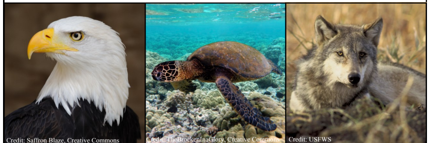
ESA listings over time, including from left to right: bald eagle (status: delisted); green sea turtle (status: endangered); gray wolf (status: delisted/some distinct population segments endangered)