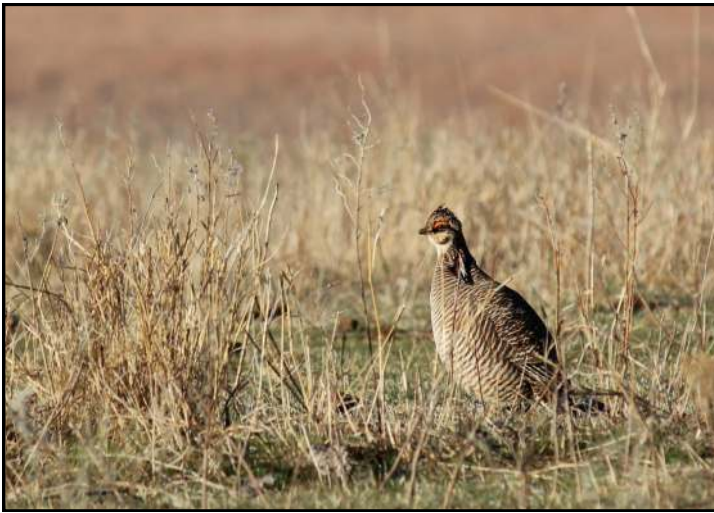
A lesser prairie chicken on its natural mixed-grass habitat in Kansas.