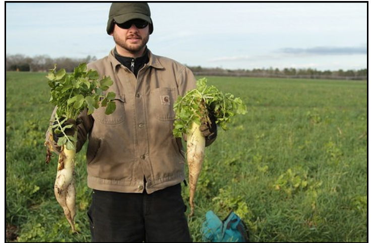
A farmer in South Carolina shows off radishes from a multi-species cover crop pilot program funded partly by a CIG.

Conservation Innovative Grants (CIG) leverage federal dollars to help non-federal governments, individuals, and private firms invest in new conservation technologies. EQIP funds are awarded annually by NRCS using a competitive grant system in order to foster the development and adoption of new conservation techniques and technologies, providing more options to address natural resource concerns on agricultural land. CIG awards have been used to develop and spread the use of best management practices such as no-till soil conservation and winter cover crops.