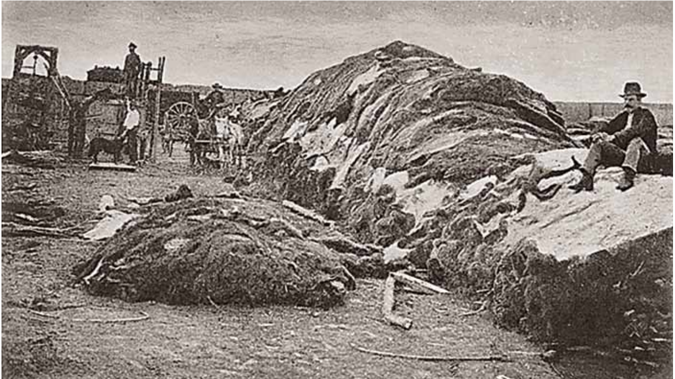
Some 40,000 bison pelts in Dodge City, Kansas await shipment to the East Coast in 1878—evidence of the rampant exploitation of the species. The end of market hunting and continuing conservation efforts have given bison a new foothold across parts of their historic range, including Yellowstone National Park.

failures, and acted on them with insight and resolve. The Canadian effort revolved around the Commission on Conservation, which was constituted under The Conservation Act of 1909. The Commission was chaired until 1918 by Sir Clifford Sifton and consisted of 18 members and 12 ex-officio members (Geist 2000).