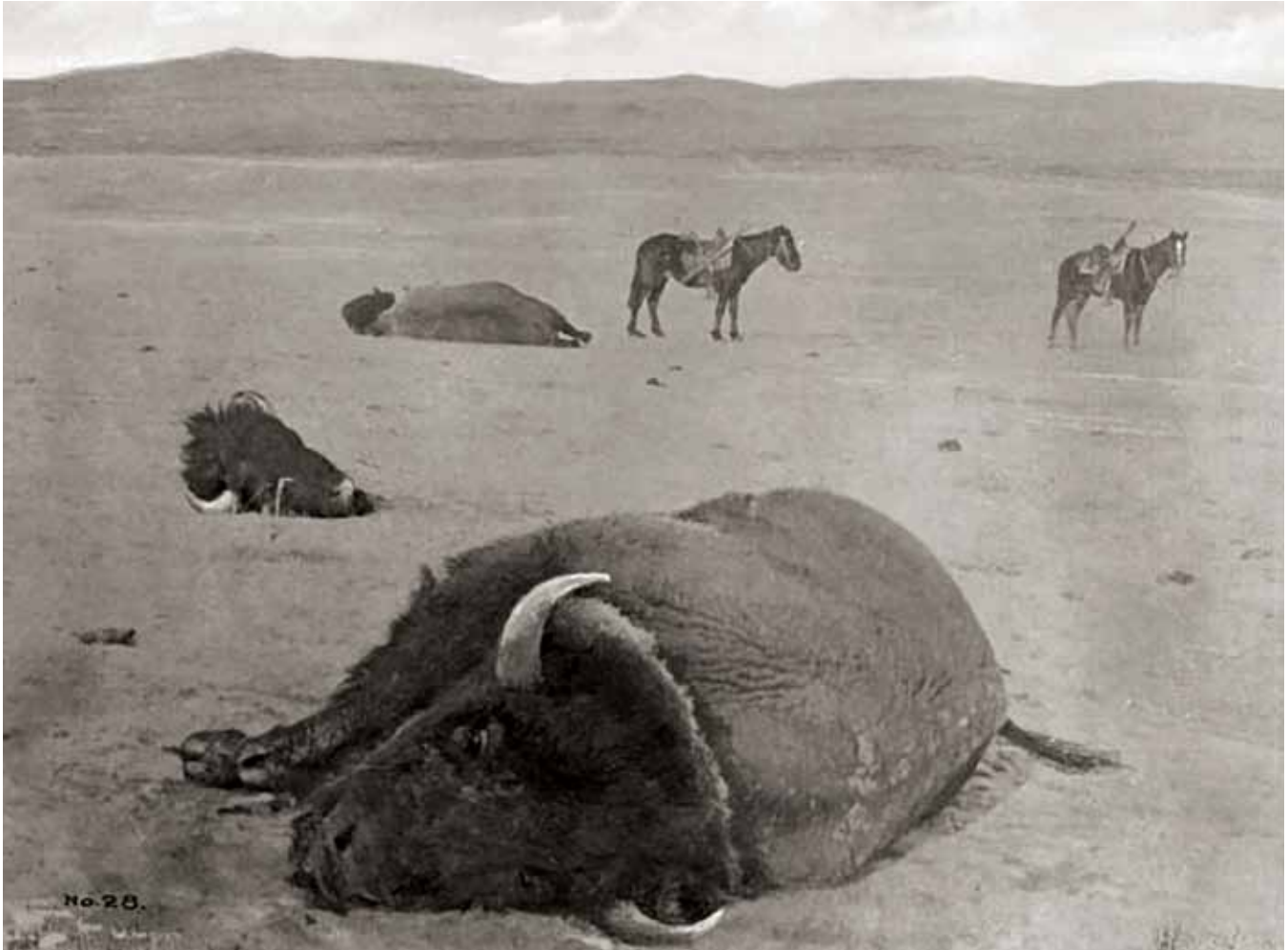
Dead bison.

Funding. — Fish and wildlife conservation funding in the U.S., at least at the state level, typically is characterized as a user-pay, user-benefit model. From the earliest days of active management and enforcement by nascent state fish and wildlife agencies, hunters, anglers, and trappers have funded restoration and conservation initiatives. License and permit fees, a motor boat fuels tax, and excise taxes on hunting, shooting sports, and angling products provide dedicated funding for habitat conservation, harvest management, research, restoration, and monitoring initiatives by state agencies. The excise tax programs have permanent, indefinite appropriation status, which means that the revenues are automatically distributed to the states each year and not subject to congressional whim.