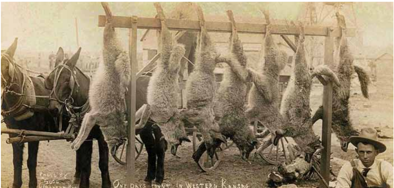
Early settlers killed wolves and other predators with abandon, blaming them for declines in game populations.

It appears that at the turn of the century, when both nations had become cognizant of wildlife’s plight and grappled for solutions, like-minded elites arose on both sides of the border who knew and befriended each other, learned from each other’s successes and