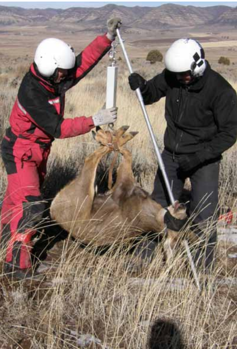
Weighing a fawn during studies of density dependence in Colorado.

P residents of The Wildlife Society (TWS) occasionally appoint ad hoc committees to study and report on selected conservation issues. The reports ordinarily appear as technical reviews or position statements. Technical reviews present technical information and the views of the appointed committee members, but not necessarily the views of their employers.