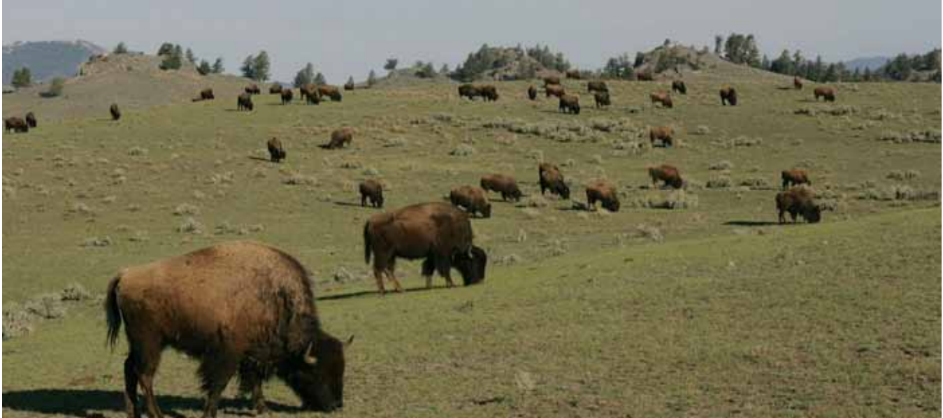
Bison (Bison bison) in Yellowstone National Park.

T he North American Model of Wildlife Conservation is a set of principles that, collectively applied, has led to the form, function, and successes of wildlife conservation and management in the United States and Canada. This technical review documents the history and development of these principles, and evaluates current and potential future challenges to their application. Describing the Model as North American is done in a conceptual, not a geographical, context. Wildlife conservation and management in Mexico developed at a different time and under different circumstances than in the U.S. and Canada. The latter two were hand in hand. The history, development, and status of wildlife conservation and management in Mexico are outlined separately as part of this review.