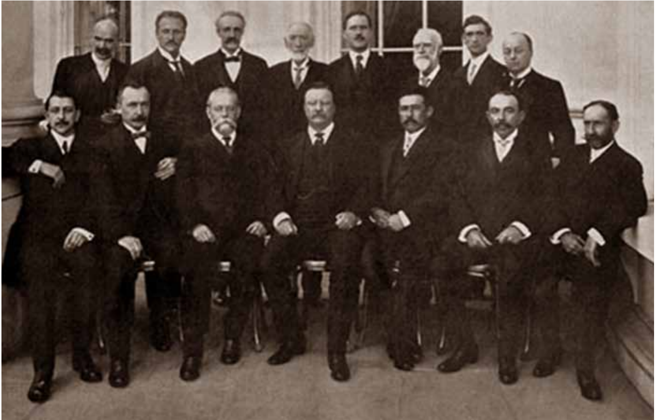
Commissioners representing Canada, Mexico, and the United States at the 1909 North American Conservation Congress. President Theodore Roosevelt sits at center.