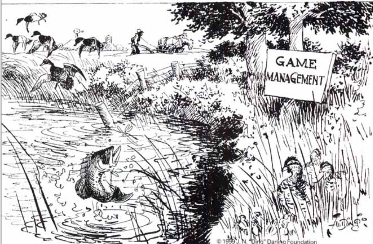
The cartoons of avid hunter and conservationist Jay "Ding" Darling spoke powerfully of the need for active game management to ensure the health of species and habitats. A Pulitzer Prize-winning cartoonist, Darling designed the first Federal Duck Stamp in 1934.