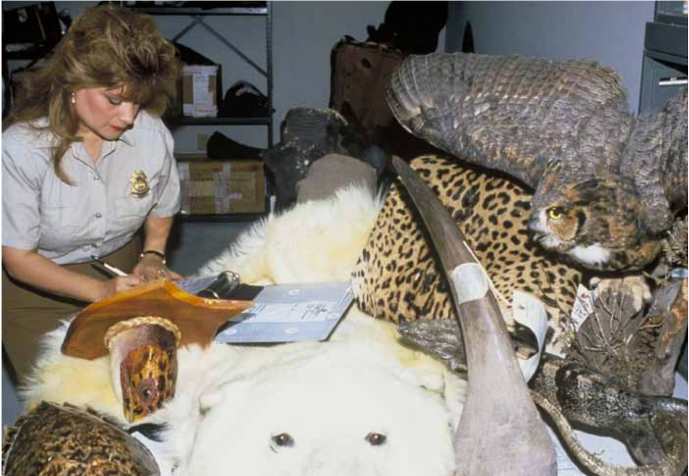
International trade in wildlife products came under greater scrutiny with the ratification of CITES by the U.S. in 1975.

W ildlife conservation varies worldwide in its form, function, and underlying principles. In recent years, efforts have been directed to describe the key attributes that collectively make wildlife conservation in North America unique. Although efforts to articulate wildlife conservation in North America have come of late, awareness among practitioners in the U.S and Canada that their wildlife conservation programs differed from others around the world has existed for decades. Describing these attributes or principles can serve many purposes: foster celebration of the profession’s maturation