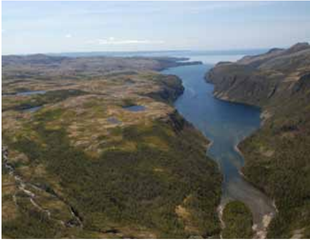
Application of the Model's principles to landscape conservation will enhance its future relevance. Credit: John F. Organ.

The Model's future rests to a high degree on the adaptability and application of its principles to contemporary wildlife conservation needs. To remain viable in the future, it must remain relevant. To that extent, the Model must be viewed as a dynamic set of principles that can grow and evolve. The underlying principles – established to address particular concerns, some no longer an issue – can serve as bedrock and be applied more broadly, or modified to facilitate expansion to emerging societal needs. Dialogue and collaboration among administrators and key stakeholders within the North American wildlife management institution should be encouraged and be constructive. In particular, the Association of Fish and Wildlife Agencies, The Wildlife Society, and the Wildlife Management Institute, among others, should collectively foster discussions about contemporary issues potentially affecting interpretation or application of the Model.