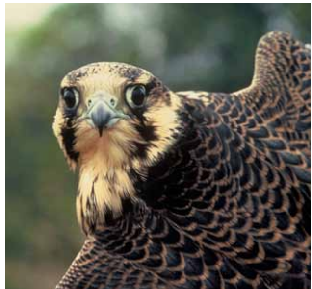
Peregrine falcons were protected in the United States under the 1973 Endangered Species Act. Recovery efforts succeeded in their restoration and removal from the federal Endangered Species List.

Wildlife conservation in Canada and the U.S. developed under unique temporal and social circumstances, and the resulting Model reflects that. Had it formed in another time and under other circumstances it would likely be different. Use of the term "North American" to describe the Model is conceptual rather than geographic. Mexico's wildlife conservation movement began its development and evolution at a different time and under different circumstances. It is unrealistic to expect that movement to mirror those of the U.S. and Canada. A description of the evolution and current status of wildlife conservation in Mexico is provided in Appendix I. Further work is warranted to compare how different temporal and social circumstances have led to different conservation approaches, identify what can be learned from those comparisons, and what is needed to advance wildlife conservation within Canada, Mexico, and the U.S.