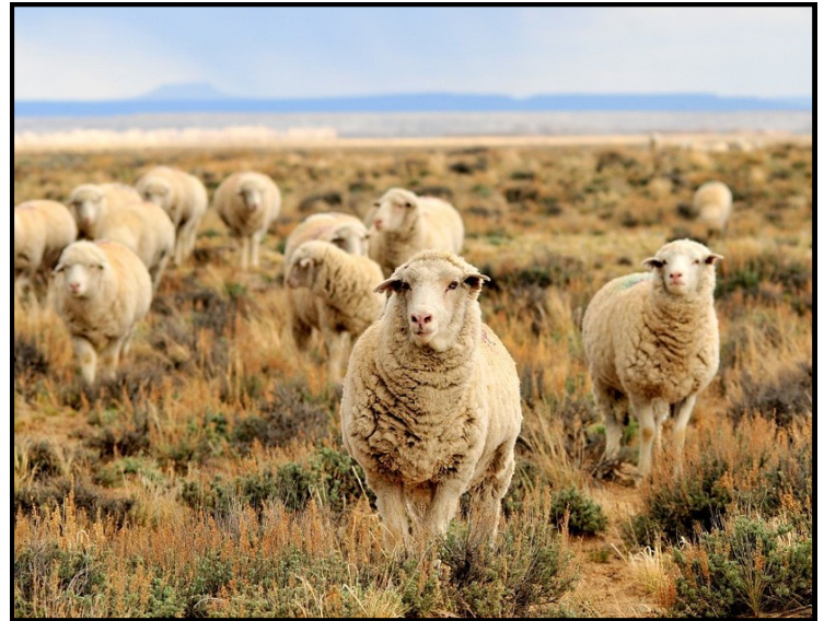
Domestic sheep are immune to the same diseases that can quickly kill large populations of bighorn sheep 10.

While domestic sheep have evolved resistance to diseases like bacterial pneumonia, bighorn sheep have not. 10 This makes bighorn sheep highly susceptible to disease and death following direct contact with domestic sheep. Experiments have indicated up to a 90% mortality rate in bighorn sheep populations within two months of exposure to domestic sheep. 11