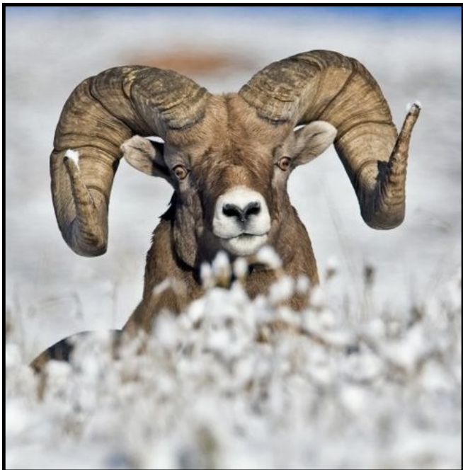
Some subspecies & distinct population segments of bighorn sheep are federally listed as endangered species.

Bighorn sheep evolved in North America thousands of years before the introduction of domestic sheep by European settlers. The domestic sheep brought novel diseases to which native sheep had never evolved a resistance. Moreover, bighorn sheep venture widely in search of resources and other herds, thereby increasing contact with domestic sheep and facilitating the spread of disease. 2