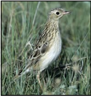
Sprague's Pipit (Credit: Bob Gress, USFWS).