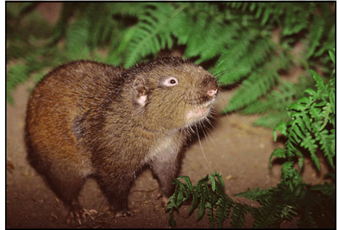
Mountain beaver

The mountain beaver ( Aplodontia rufa ) was reassessed as a species of special concern under SARA in 2012. The Mountain beaver is found in British Columbia, but its range has decreased by 29% in the last 50 years due to habitat loss. Habitat destruction has been caused by soil compaction and disturbance by heavy machinery during forestry activities and urbanization. Federal and provincial governments created a management plan for the mountain beaver in 2013 to improve the abundance of the species in British Columbia. This will be achieved through the implementation of best management practices for timber harvesting in areas occupied by mountain beavers and conservation of other mountain beaver habitat. The goal is to prevent the mountain beaver from being listed as threatened under SARA.