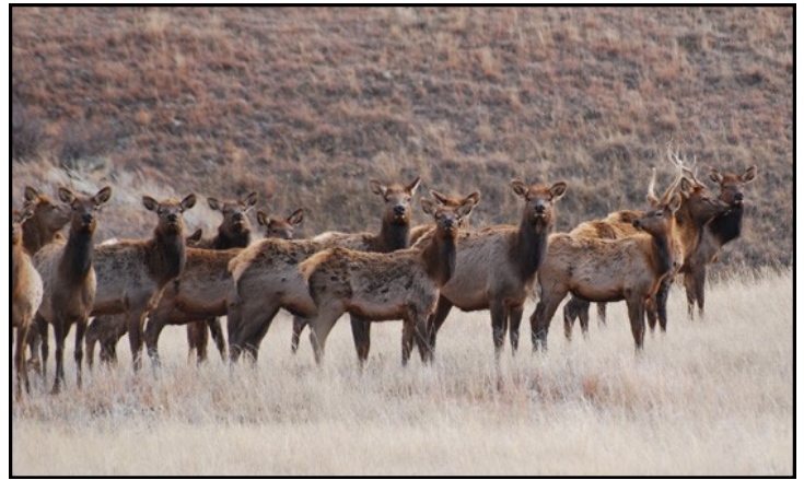
A herd of elk at Wind Cave National Park in South Dakota.

Elk herds are a huge draw to the Black Hills National Forest (BHNF) and Wind Cave National Park (WCNP) in South Dakota. Hunting and tourism bring in state revenue and are a large part of the local culture. $7.15 million in LWCF funds were used to purchase a 2400 acre ranch adjacent to the BHNF and WCNP. Elk herds consistently travel between the two federal areas and the private ranch. By incorporating the ranch into federal property, the elk herd (which uses the private ranch frequently) could be more effectively managed and more easily accessed by hunters and hikers alike.