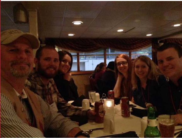
University of Arizona students and the Arizona Game and Fish Department school liaison at the closing night banquet.

Each of our undergraduate attendees has plans to attend graduate school. In addition to the connections we made with professionals, attending research presentations and posters was also a valuable experience. I made it a priority to attend every talk that is relevant to my recently secured graduate research project. After these presentations, I made a point to talk with each presenter. By doing this I have created a network of professionals and students that are interested in the outcome of my project and willing to share knowledge from their experiences in. These connections provided a solid foundation for my professional development.