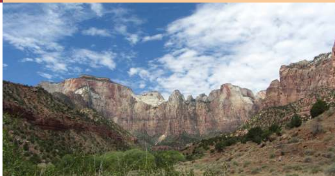
Zion National Park, UT.