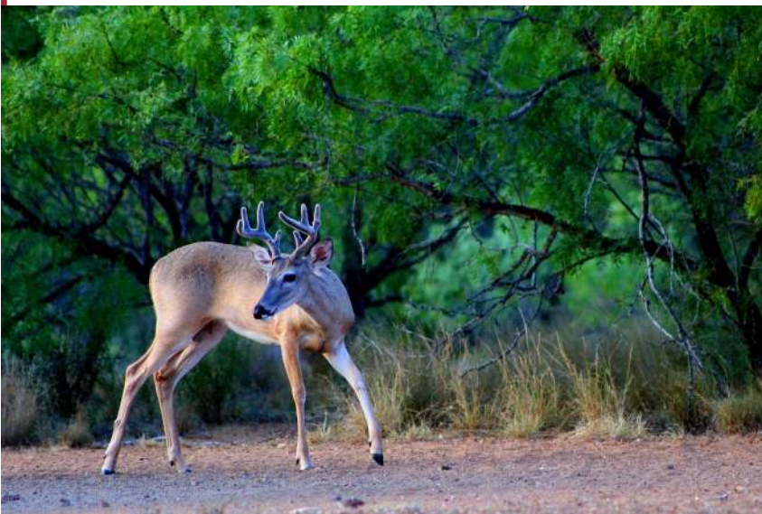
South Texas White-tailed Deer.