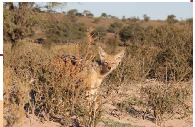
Black-backed Jackal in southern Namibia, Africa. (Photo credit Amanda Veals).

Austin Klais (honorable mention): "Activity patterns and interspecific interactions of free-ranging domestic cats at urban feeding stations."