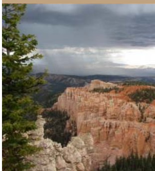
Bryce Canyon, UT.