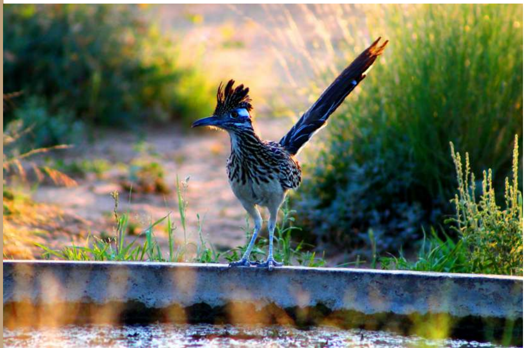
Greater Roadrunner drinking from a water catchment in south Texas. (Photo credit Levi Heffelfinger).

Information will be updated as it becomes available.