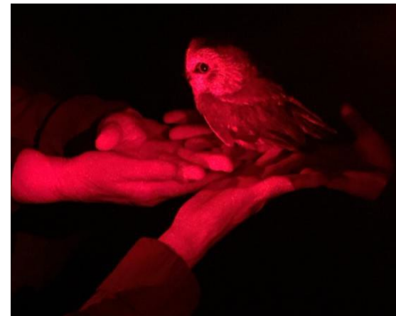
Saw-whet owl banding