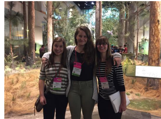
TWS National Conference, Raleigh, NC

All in all, this fall semester is going better than I anticipated for our chapter. With a great team of officers and a new batch of devoted members, the rest of the fall semester is poised to become one for the books!