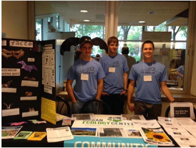
Wisconsin Bat Festival, Milwaukee

Education Group Inc.. Six UWSP students also participated in the Wisconsin Chapter technical training trapping matters workshop.