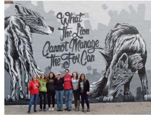
UW-Madison and UW-Stevens Point students enjoying their time after the trapping matters workshop.

Education Group Inc.. Six UWSP students also participated in the Wisconsin Chapter technical training trapping matters workshop.