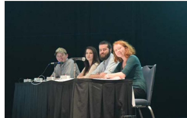
UWSP Quiz Bowl team

Four students represented UWSP in the quiz bowl competition. Even though they didn't proceed to the second round, they enjoyed the competition.