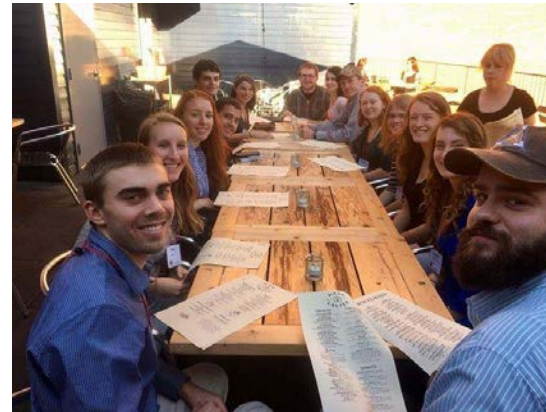
UWSP National Conference attendees