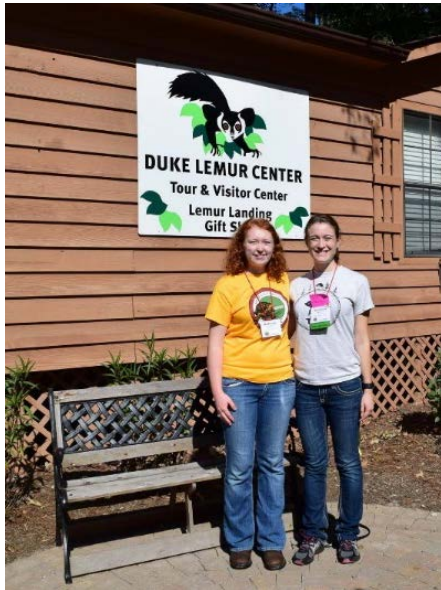
Students enjoying their time at a TWS conference field trip.

Four students represented UWSP in the quiz bowl competition. Even though they didn't proceed to the second round, they enjoyed the competition.