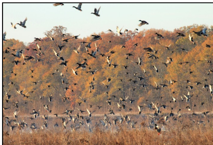
Mallards taking flight in the flooded grasslands of Overflow National Wildlife Refuge in Arkansas.

Duck Stamp revenue provided 100% of the funds to purchase the 13,000 acre Overflow National Wildlife Refuge in Arkansas. 7 This refuge protects some of the last remaining bottomland hardwood forests – and the wildlife that rely on it – conserving black bears, bald eagles, wintering mallards and wood ducks, and migrating shorebirds.