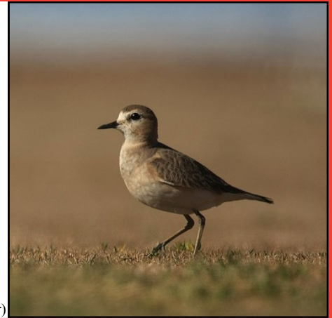
Mountain plover

STWG funds can be used for a variety of conservation activities. In Nebraska, biologists used STWG funding to survey the range of the mountain plover ( Charadrius montanus ). Prior to the survey, the biologists knew of only two nesting pairs of the species in Nebraska. Throughout the survey hundreds more of the birds were discovered. The survey also increased the biologists' knowledge of habitats where the birds nest, indicating the common use of fallow farm lands. With that information, biologists were able to encourage farmers to till around the nests, thus increasing the survival rate of chicks. Nebraska now has a thriving mountain plover population, which helped contribute to the USFWS decision to not list the mountain plover as threatened or endangered in 2011.