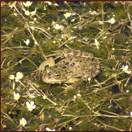
Columbia spotted frog

The Columbia spotted frog ( Rana luteiventris ) was designated as a candidate species for ESA listing in 1993. STWG funds were utilized in Utah to repatriate and successfully establish two populations of the frog in areas where they have been extirpated for over 30 years, thus helping to prevent the species from becoming endangered. STWG funds also provided the resources necessary to conduct the research used by USFWS in 2015 to determine that the species did not warrant federal listing. Through collaborative efforts—including clarifying objectives, utilizing sustainable grazing practices, creating ponds, and implementing effective conservation strategies—the frog population has rebounded across its range.