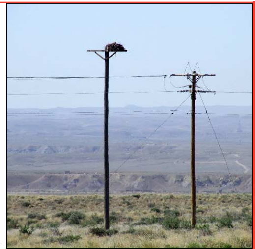
Nesting platform

CEQ defines a Categorical Exclusion (CATEX) as any "category of actions which do not individually or cumulatively have a significant effect on the human environment." Each agency may establish a CATEX within their adopted NEPA Implementing Procedures for any federal actions that, "based on past experience with similar actions, do not involve significant environmental impacts." Since these actions do not have a significant impact, "neither an environmental assessment nor an environmental impact statement is required." Examples of a CATEX activity for the Bureau of Land Management includes constructing nesting platforms for wild birds and constructing snow fences for safety.