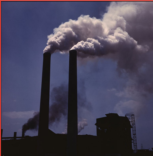
Smoke stacks

CEQ defines the "human environment" as the natural and physical environment and the relationship of people with that environment. As a result, actions that only produce economic or social effects in the absence of environmental effects, do not require preparation of an EIS. There must be some type of environmental effect associated with the proposed action. Once the potential environmental impact is established, however, all ecological, aesthetic, historic, cultural, economic, social, or health impacts as interrelated with the natural or physical environmental effects must be considered in the EIS. Depending on the scope of the proposed action, the agency preparing an EIS may have to consider a complex matrix of effects.