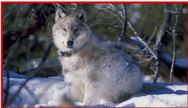
Radio-collared gray wolf.