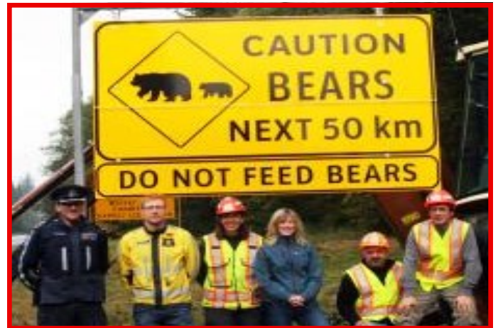
The District of Squamish in British Columbia, Canada, a certified Bear Smart community.