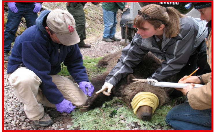
Collecting data from a tranquilized grizzly bear in Glacier National Park prior to attaching a radio collar.