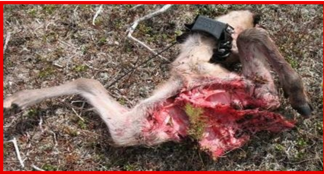
A caribou calf, killed by predators in Newfoundland, was fitted with a radio collar as part of study on calf mortality.